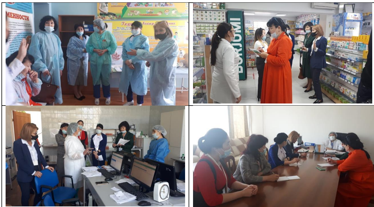
Photo 7. Visiting EEC clinical sites.

According to the programme, members of the EEC demonstrated the Paragraph of Bilim information and educational platform used for DO: electronic journal, schedule, statements, lists of groups, etc.