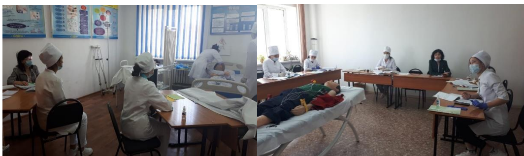
Photo 8. Visiting EEC practical training.

All attended classes are provided with a working curriculum, control and measuring instruments, demonstration and handouts, equipment for individual practicing skills.