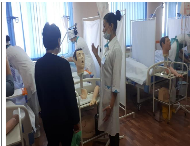
Photo 4. Overview of educational resources.

Members of the EEC visited the test center, museum, dormitory "House of Students" of the college, canteen, first-aid post, sports complex, assembly hall. The department of information support, consisting of three computer classes, was examined (84 computers, 97 laptops, 5 tablets connected to the Internet and 2 projectors were involved in the educational process).