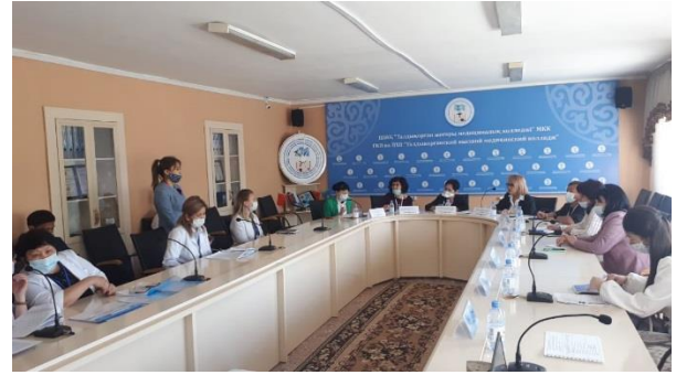
Photo 3. EEC conducts an interview with the chairperson of the CEP and the heads of the offices.